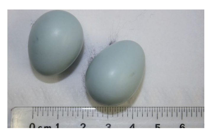
Indian myna eggs