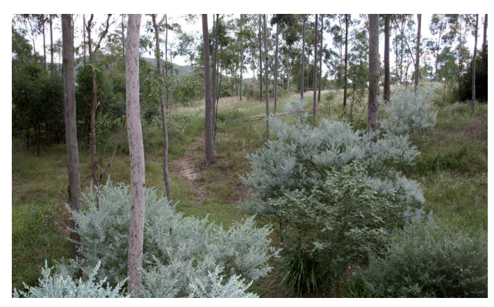
Native habitat restoration discourages Indian mynas

Indian mynas thrive in disturbed habitat. Retaining or restoring native habitat will provide an environment more suitable for native species. Planting local native trees and shrubs and reducing lawn areas will also make the environment less attractive to Indian mynas and encourage native species.