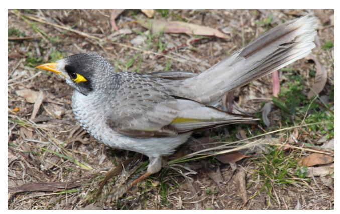
Native noisy myna

Further information is available from your local government office, or by contacting Biosecurity Queensland on 13 25 23 or visit www.biosecurity.qld.gov.au.